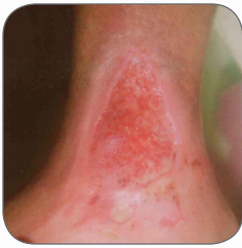
Lateral Aspect of L Malleolus