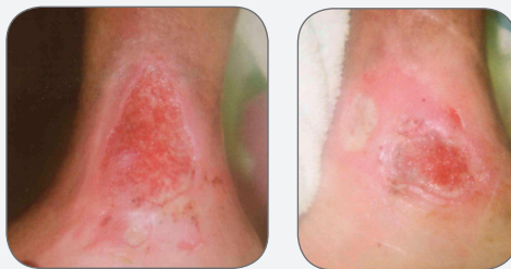
INITIAL WOUND PRESENTATION