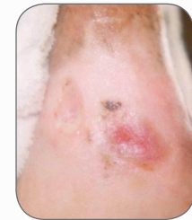
Medial Aspect of L Malleolus